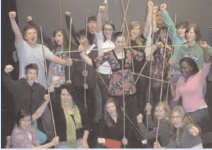
Students from the Shout Out class prepare for All the World's a Stage